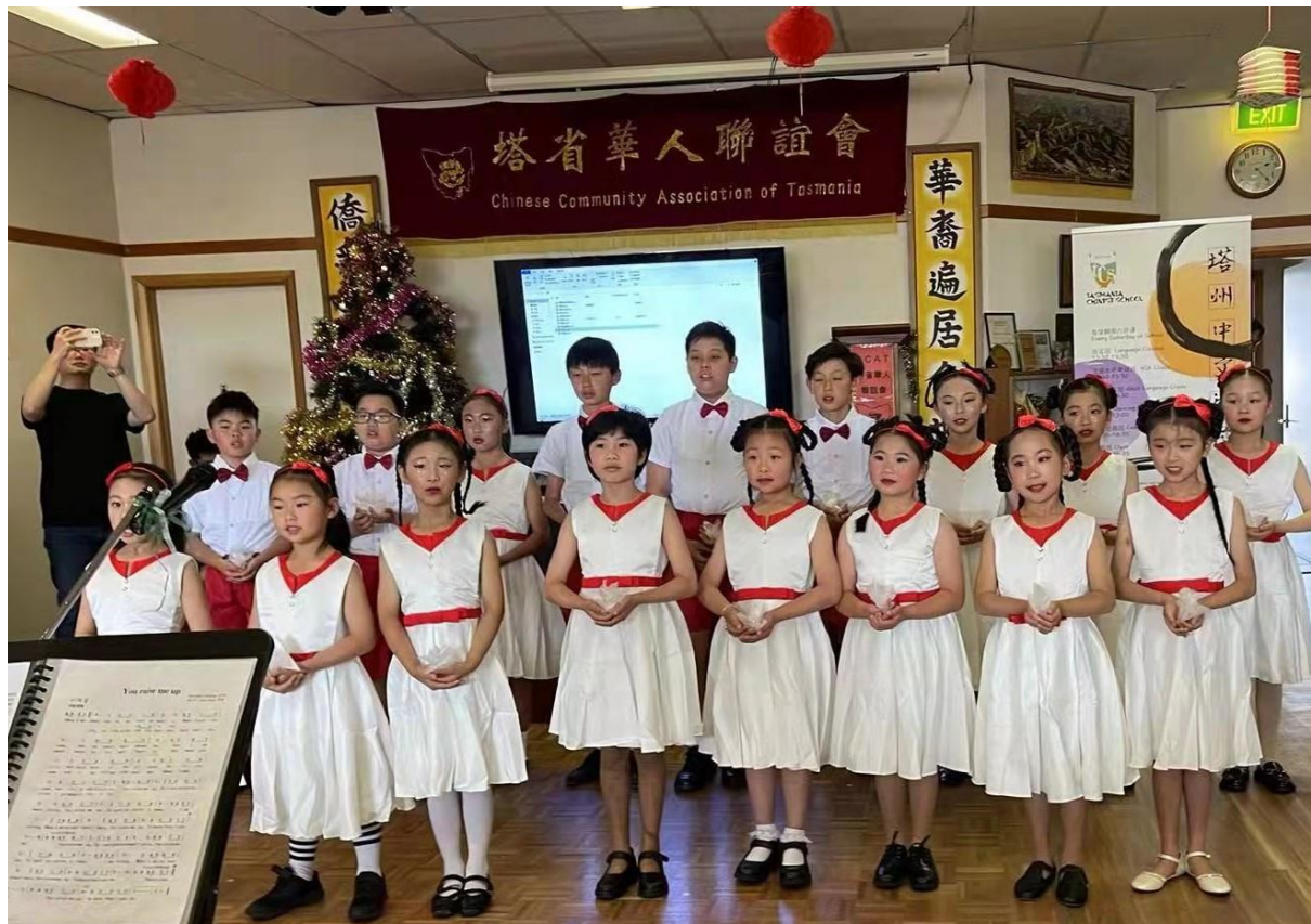
Choral Class 合唱班

然后每个班级都进行了许多不同的并且通常是精彩的表演，太多了，无法在此一一列举。然而，新成立的 2021 合唱班的“雪绒花”和“You Raise Me Up”的演绎值得特别一提，因为它表明学校致力于全面学习东西方。